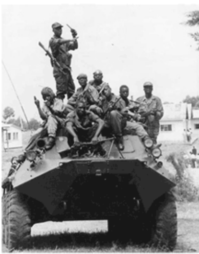
UPDF soldiers celebrate their warfighting capabilities

continue to circulate in the U.S., all furthering the pro-RPA and pro-Tutsi perspective of the Hutu genocide.