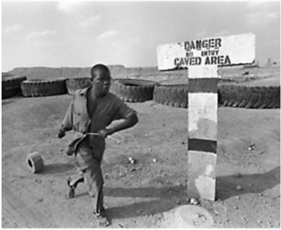
The open pit mines are an environmental nightmare

survival sex involving both Armed Forces of Democratic Republic of Congo (FARDC) and MONUC troops. “FARDC further prey on female sex workers by forcing sexual relations, raping those who refuse, and universally robbing desperate females of their livelihood,” SRI wrote.